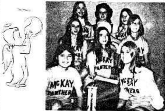
THE GIRLS VOLLEYBALL TEAM